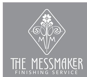
Inverted Symbol variant